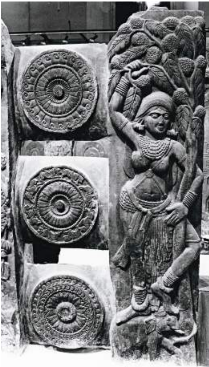
4. Chulakoka Devata, Bharhut, Indian Museum, Calcutta

Since 2011, the US Immigration and Customs Enforcement's Department of Homeland Security (ICE/DHS) has been investigating the activities of an Indian antique dealer, Subhash Kapoor, based in New York. According to their own records, antiquities worth US $ 100 million allegedly illegally exported, in plain language, smuggled, from India and other South Asian countries were recovered in raids on Kapoor's shop ART OF THE PAST. Kapoor has been running his family business for many decades, and his client base is spread over four continents – the US, Europe, Australia and Asia. The World's Press has been reporting these investigations spreading alarm among several museums and collectors that the art they received from Kapoor was illegally exported from their original countries.