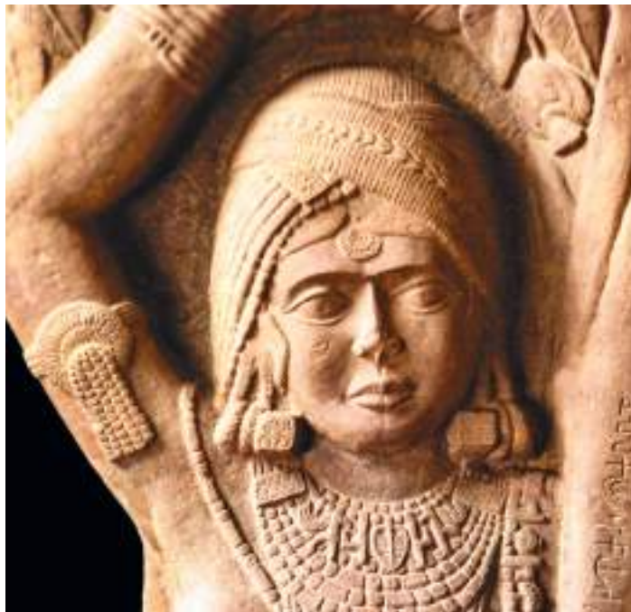
7. Mahakoka Devata, Bharhut Detail of 5: embellished headgear, ear ornaments, facial tattoos, amulet-strung necklace and armllets

Like most Bharhut inscriptions, the one on Mahakoka is brief, just twenty-four letters recording the gift of the goddess in the Brahmi script of the second century BCE