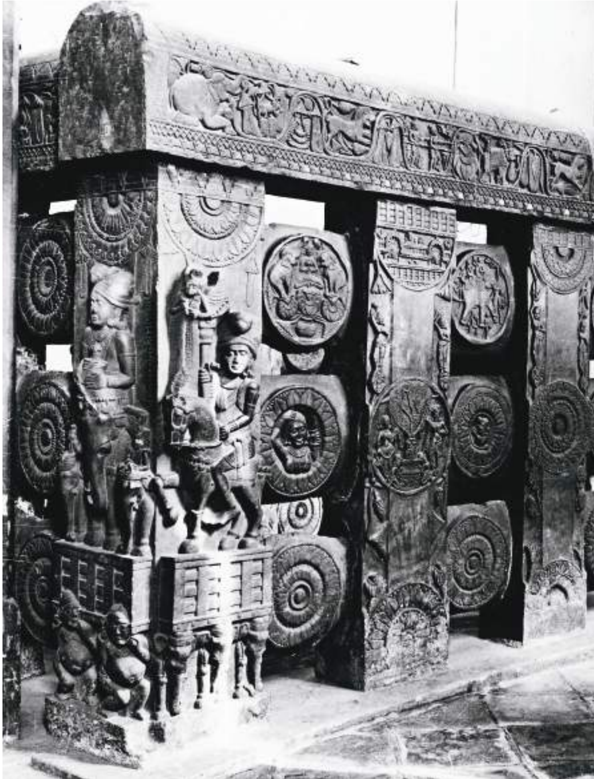
3. A section of the Bharhut railing, Indian Museum, Calcutta Photograph: American Institute of Indian Studies, Digital South Asia Library, Gurgaon, (AIIS), No.35301

Museum, the Allahabad Museum, the Museum at Ramban near Satna and the National Museum of India in New Delhi. The Freer Gallery of Art in Washington acquired four sculptures in 1932 before India’s independence, which were published by Ananda Coomaraswamy in La sculpture de Bharhut . 6 Thus, if any collection other than those that officially received Bharhut’s antiquities possesses anything from the site, the source needs to be explained.