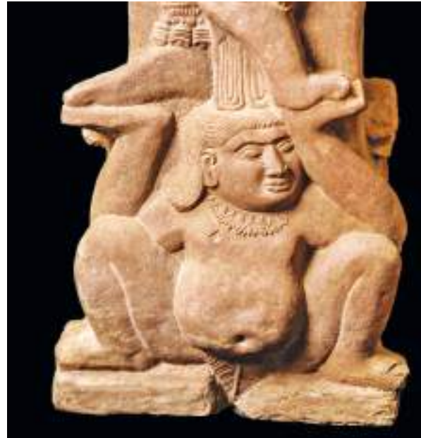
8. Mahakoka Devata, Bharhut Detail of 5: dwarfish figure support of Mahakoka