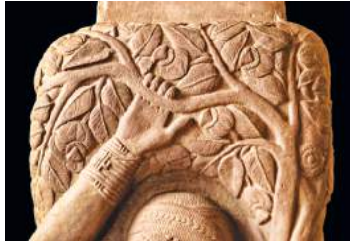
9. Mahakoka Devata, Bharhut Detail of 5: tree provisionally identified as Neolamarckia cadamba or the Kadamba tree