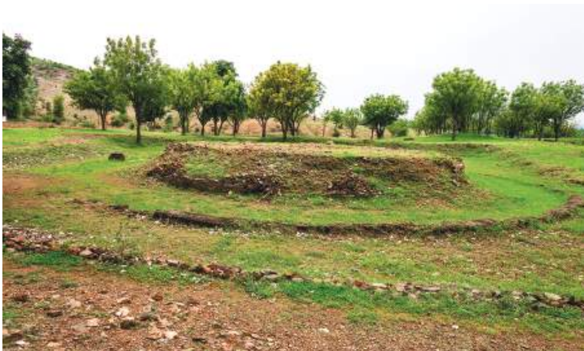
2. Stupa site, Bharhut, July 2012

Hundreds of architectural pieces including torana uprights, lintels, railing pillars, cross bars, coping stones, medallions, figures of Yakshas, Yakshis, Devatas, and human characters recovered from the stupa were transported to Calcutta. However, the monument had been greatly disturbed over the centuries. It had served as a quarry for building materials for neighbouring villages. Some dispersed pieces