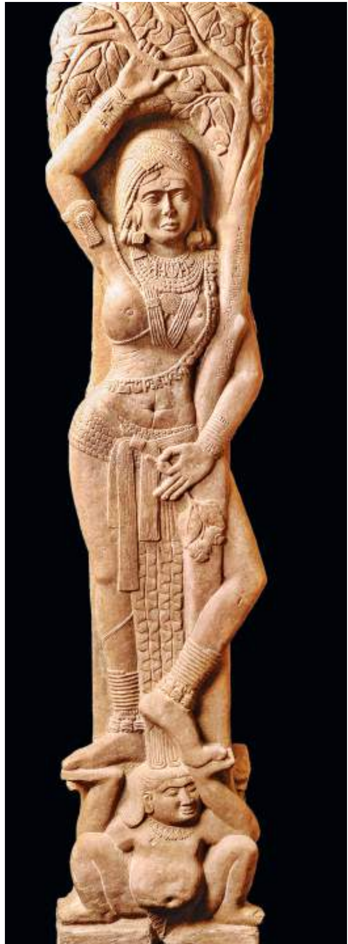
5. Mahakoka Devata, Bharhut

Mahakoka, like the other figures from Bharhut, is clad in a diaphanous lower garment reaching below the knees, which is discernible only from the ridge of the hem and the thick folds gathered up in front (5). The bosom is apparently bare, but four incised curved lines under the right breast suggest that there is a fine upper garment as well (5, 6) exactly as is the case with Yakshi Chanda as observed by Cunningham. 8