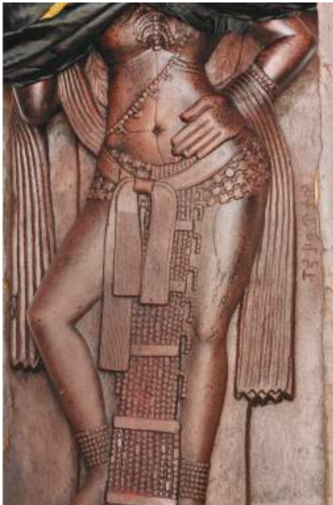
11. Female figure in a local shrine, Batanmara, Satna district Partial view of the collar strung with charms and amulets similar to Mahakoka Devata

From this writer's perception, international security agencies who intercept smuggled art are keen to restore it to India after observing due legal processes, more than our agencies are on retrieving that art. Two amorous couples stolen from the protected site of Atru in eastern