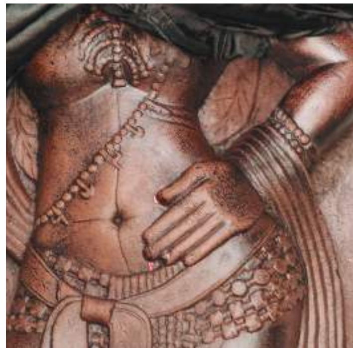
Detail of 11