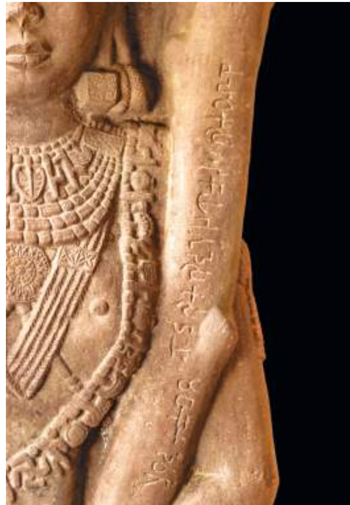
12. Mahakoka Devata, Bharhut Detail of 5: Inscription