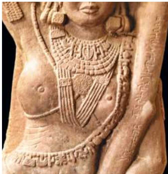
6. Mahakoka Devata, Bharhut Detail of 5: ornaments and folds of upper garment

A dwarf with long plaited hair, a necklace and a leaf as his loin cloth, is stout and handsome in his own