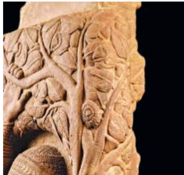
10. Mahakoka Devata, Bharhut Detail of 5: tree shading her, shown in profile